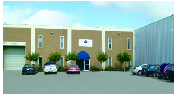
Sunair's two story headquarters in the United States (20,000 sq ft, 1,900 sq m)