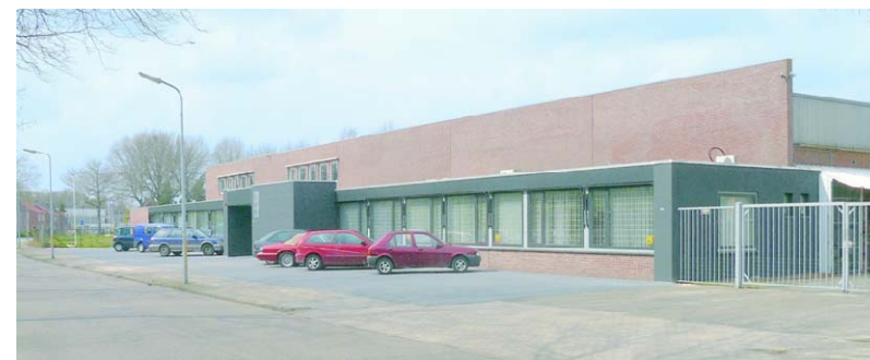
Sunair Europe's two story headquarters in The Netherlands (48,000 sq ft, 4,500 sq m)