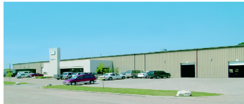
Sunair's warehouse in the United States (42,000 sq ft, 3,900sq m)